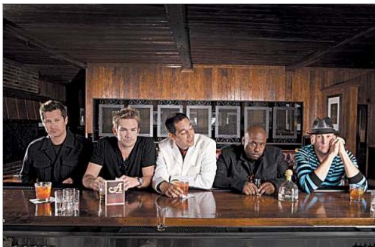
ON THE ROCKS Rivers Cuomo pops up alongside McGrath, second from left, to duet through "Love Is the Answer," an unreleased Weezer song, on Sugar Ray's new album.